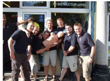
Well done to our 6 new EFR Instructors