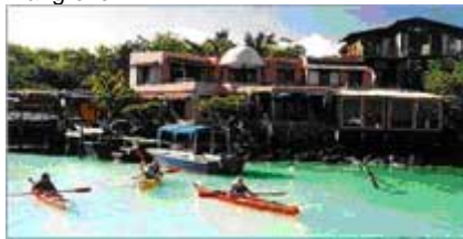
Red Mangrove Inn

Sunday: Flight Quito / Baltra. Hotel check in. (the afternoon is a good opportunity to visit the Charles Darwin Foundation which is next door to the hotel. Accommodation in the Red Mangrove Inn.