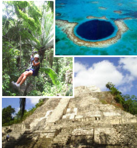
Jungle Treks, Mayan Ruins, and the famous Great Blue Hole. Belize has it all!

you want to go and for flights to have increased in price.