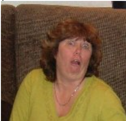
Mystery woman turns up at club meeting again

The next monthly meeting will be on 2 March in 2006. There is no February meeting as the Valentines Ball is on. As usual it will be in the Coast Bar, Royal Beach Hotel. Please let us know if you will be coming. Those of you who went to the last meeting will have noticed a relative of that mystery woman turned up again. Any ideas?