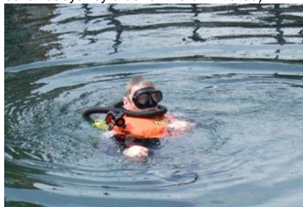
Siebe Gorman Mistral with Fenzy

After a bit of cannibalism, TLC and some simple manufacturing, we got 3 of the twin hoses working and in the water during the Waterfront festival along with some refurbished 1960s and 70s ABLJs (big horse collar buoyancy aids for the uninitiated).