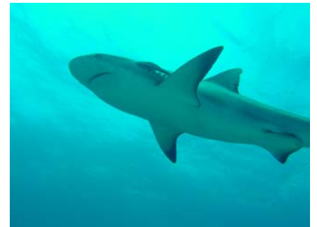
A cruising reef shark on Abaco

Boat option number 1 was based in Abaco, about 150 miles from Nassau. The first lesson learned - always put a scale in a picture. The boat that we thought was a small one was actually huge - and a big problem to get it cleaned. The dive site in Abaco was also an issue. It faces the Atlantic swells and the full force of hurricanes so the site had to be protected. On the day we dived there were 10 ft swells being blown in by a strong wind so it gave an impression of what it might be like in a big storm. The site at Manjack Cay had plenty of life with huge grouper, Caribbean Reef sharks and Nurse sharks cruising around, but the current was a concern as we struggled to fin against it.