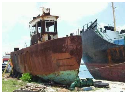
The Tug on Nassau

Gentle currents, some good coral life and plenty of protection from storms and the Hurricanes. This looked like the spot. But what about the boat? They had found an old tug located by the cruise ships and the company that owned the land were dying to get rid of it. Made of steel it has loads of character and with a bit of "tarting up" should be just what we need. All we have to do now is get it cleaned, cut some holes in it – and make sure we can get it to float for long enough to set up for filming.