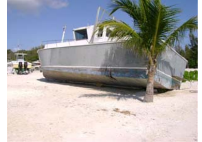
The Abaco Wreck

let you sink it) and the tourist board (who let you film it) all being fairly easy ..... and not the administrative hurdle expected. Even managed to sort out explosives and special effects, accommodation, discounts on internal flights etc etc. We had a couple of boats to look at.