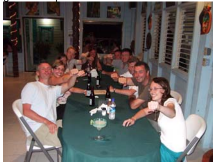
“chilled down to de core - touch me”

This is an abridged version of the Belize report so I suggest you log onto the holiday page of the website (trip reports section) to get the full picture.