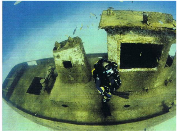
BBC series Life follows the development of marine growth on a sunken wreck

commissioned to supervise an unusual task; to find, clean and deliberately sink a wreck and film it – a first for the BBC. The wreck (a 50-tonne tug boat) was sunk in the Bahamas and provided an unusual backdrop for the filming of the development of marine life. Life will be accompanied by a Children's BBC series that follows the making of this series.