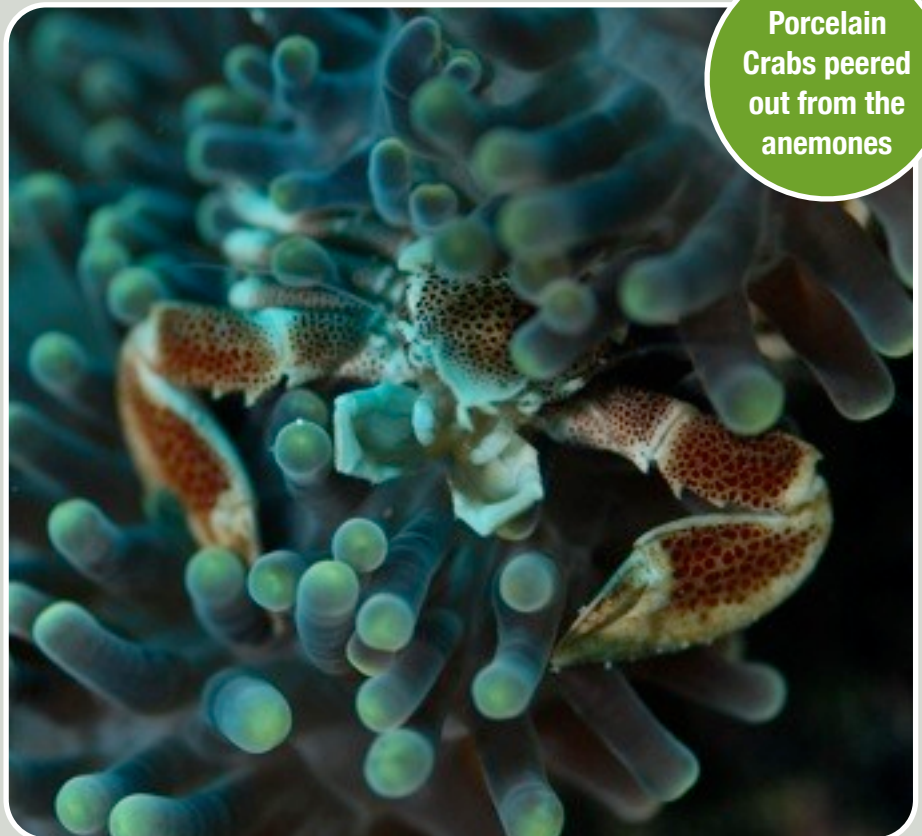
Porcelain Crabs peered out from the anemones

It was all over far too quickly, and although the "big stuff" did not rank with that found in Galapagos, or Belize, or Sipadan, it was still great diving and a fantastic trip. The Philippine people are friendly, the food and beer are cheap, the country is amazing and even having been there a few times now I would still go back any day.